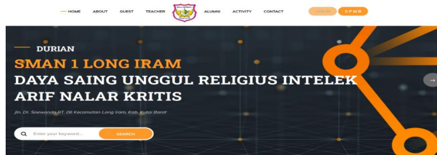
Figure 1. Initial View of the Durian Website

ranging from "strongly disagree" to "strongly agree" (Brooke, 1996). This method was chosen because of its simplicity and reliability in measuring the perception of usability of various types of systems or applications (Lewis, 2018). The initial display and login of the Durian website are seen as in Figures 1 and 2 as shown below.