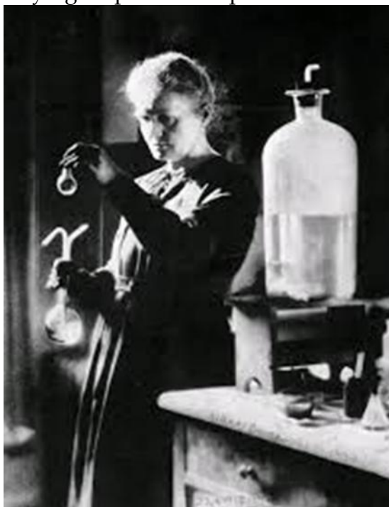
Figure 2. Scientist Marie Curie is Working in a Lab

People died, got sick, and had terrible accidents because of poor safety practices. This was a turning point in the history of lab safety that was both important and upsetting. Industrial chemistry and large-scale production grew quickly in the 20th century, especially during the two World Wars. These events made following standard safety rules for people working with dangerous chemicals even more important. Systematic safety standards were made because people were becoming more worried about their safety, environmental disasters put pressure on the government, and new biological dangers were found in fields like molecular biology. Institutions and governments initiated the implementation of Laboratory Standards and Hazard Communication Standards. The result was a big change in how lab safety was managed, moving from relying on personal experience to following the law.