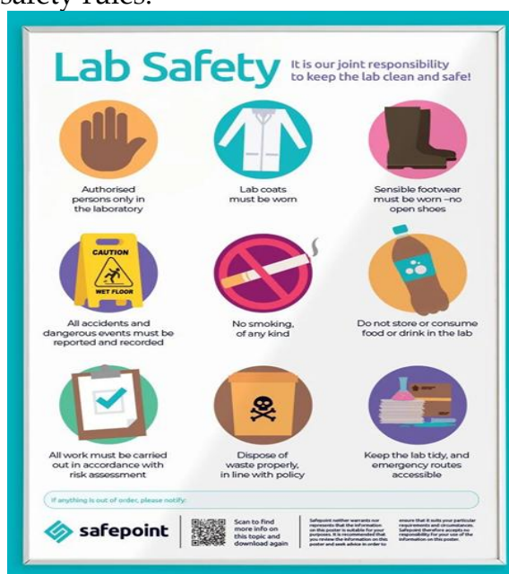
Figure 4. Lab Safety Chart

If you run your lab well, it works a lot like a controlled research setting. Standardized operating methods and strict risk management are necessary to make sure that experimental results can be trusted and used again and again. If there are chemical spills or contaminations from bad hygiene, they could ruin months of trial data and cause the wrong study conclusions to be drawn. Safety steps ensure the trustworthiness of scientific data. By creating a dependable operational framework, they make sure that every part of an experiment takes place in a space free of unexpected problems. This changes scientific research from looking for "chance findings" to looking for "inevitable certainties." Different from other ways of thinking, the scientific method lets you repeat a study while following safety rules.