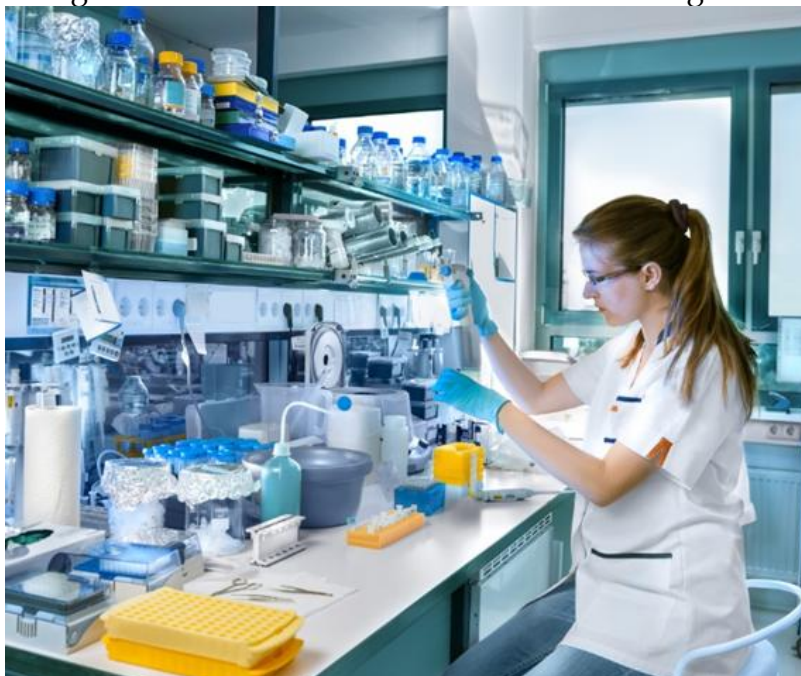
Figure 3. A Scientist Wearing Gloves and Glasses During an Experiment Protection of Human Health

We've already talked about how important it is to set broad safety norms that take many things into account. That's because of these things.